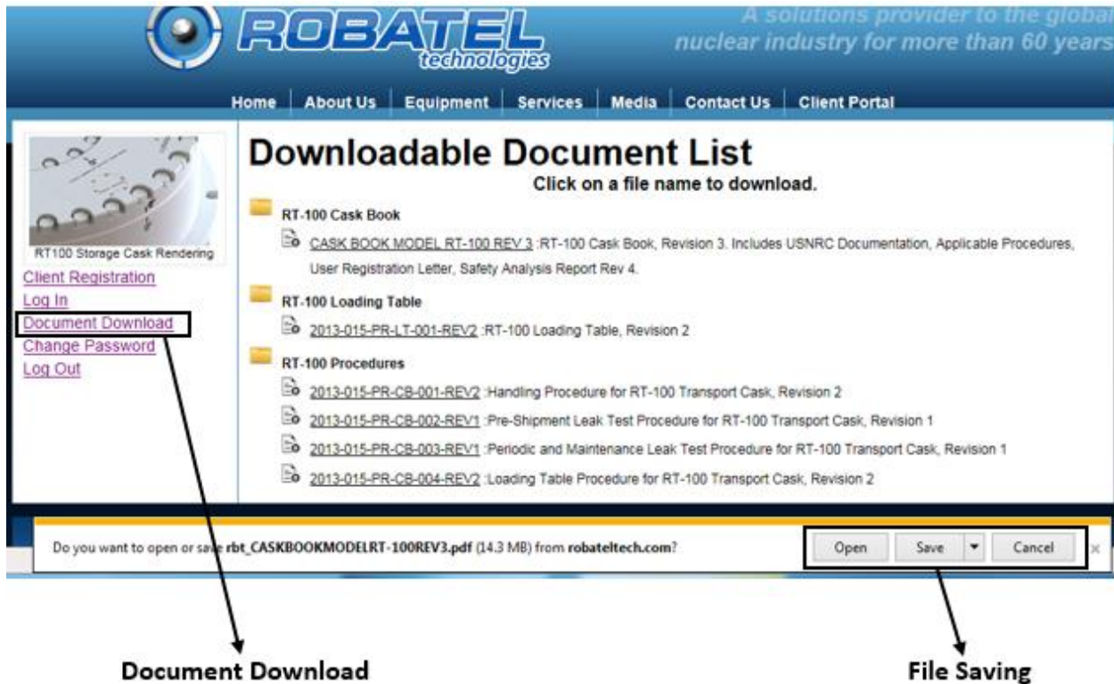
Figure 5. Downloadable Document List Window