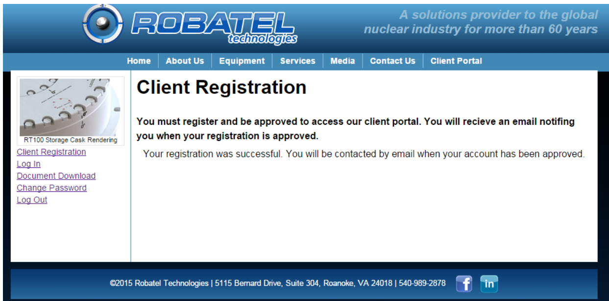
Figure 2. Customer notification when a new document is added to the client portal website

3. Once you have finished the registration process, you will see the following screen.