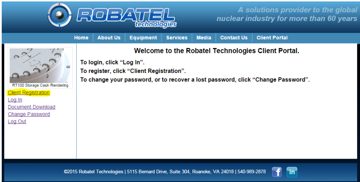
Figure 1. Client Registration Link